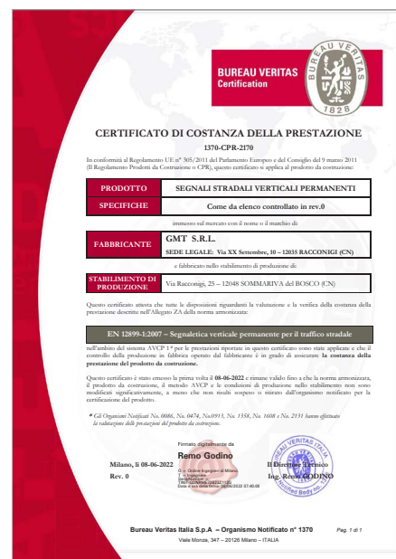
Bureau Veritas Certification for "Constancy of Performance"