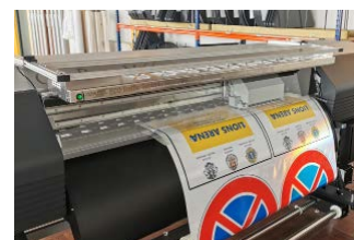
Reflective roll digitally printed