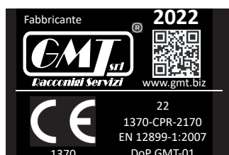
Laminated sticker of CE certification