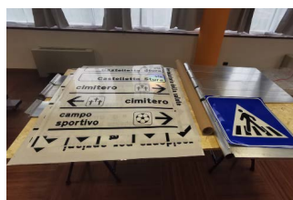
Printed and laminated reflective rolls